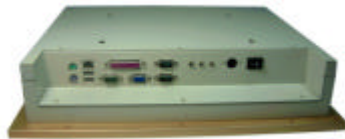
USB, LAN, Audio, 4xCOM, Printer, KB, Mouse