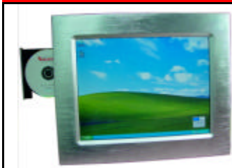
Ultra thick solid Aluminum Alloy IP-65, NEMA 4, VESA-75, 100