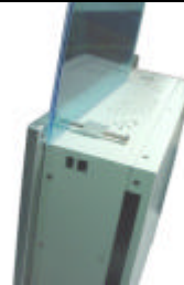
Quick wall-mounted Kit