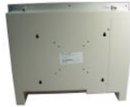
Tapped screw holes, VESA 75 and 100,