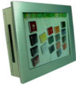
Cable-Less Design for best Vibration & Shock resistant